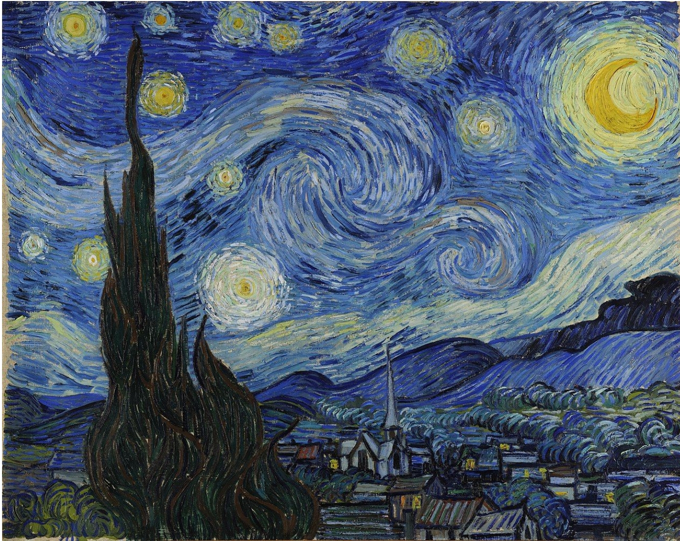
A Starry Night -- Vincent Van Gogh