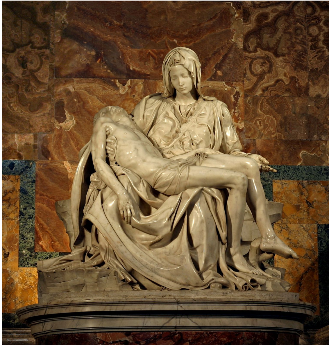
The Pieta -- Michangelo