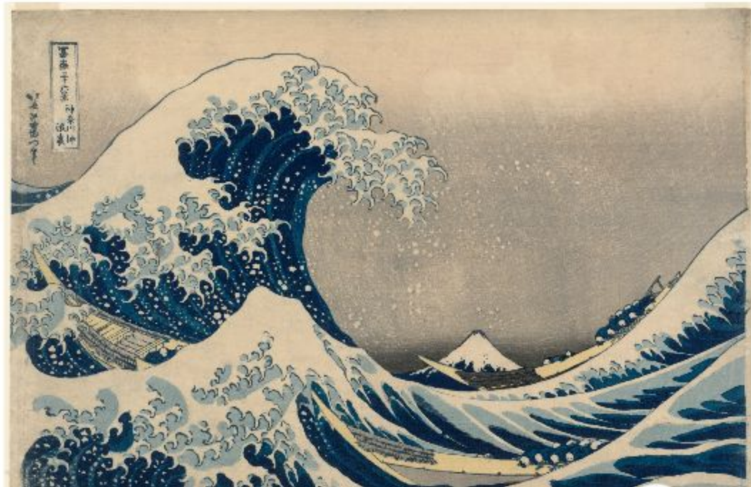
Under the Wave at Kanagawa