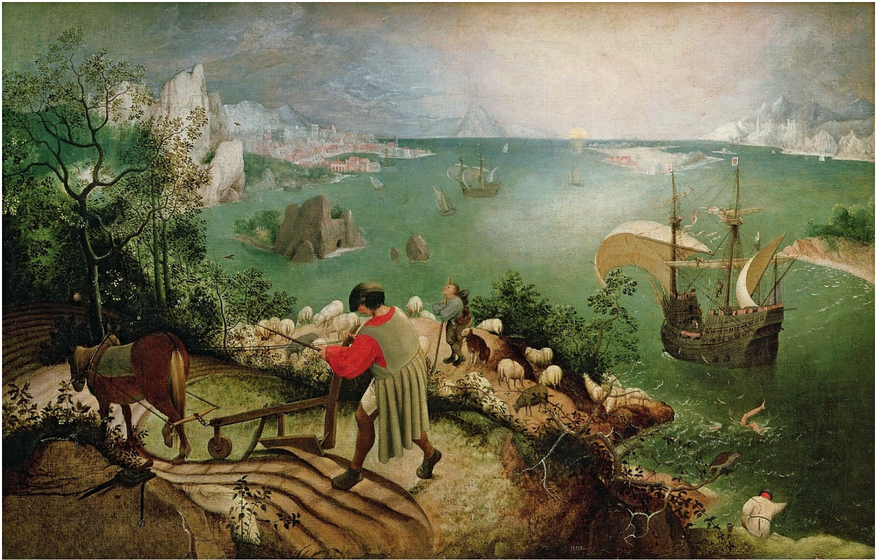
Landscape with the Fall of Icarus --Pieter Brughel